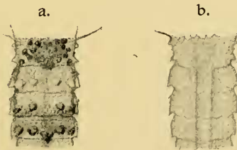
Base of the tail; 2/1 a. above, b. below.